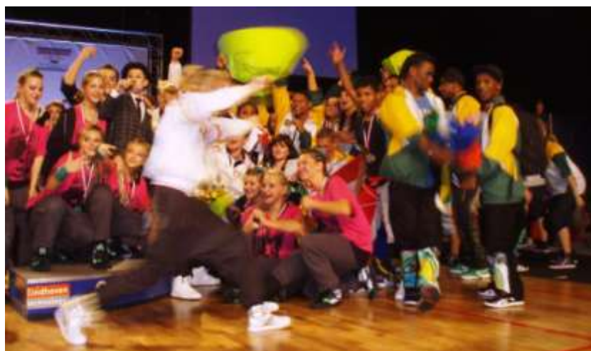
Happy athletes at Worlds Medal Ceremony in Eindhoven, Netherlands 2010.