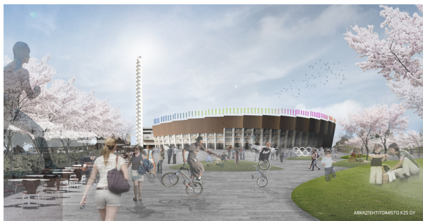
The future plan illustration picture